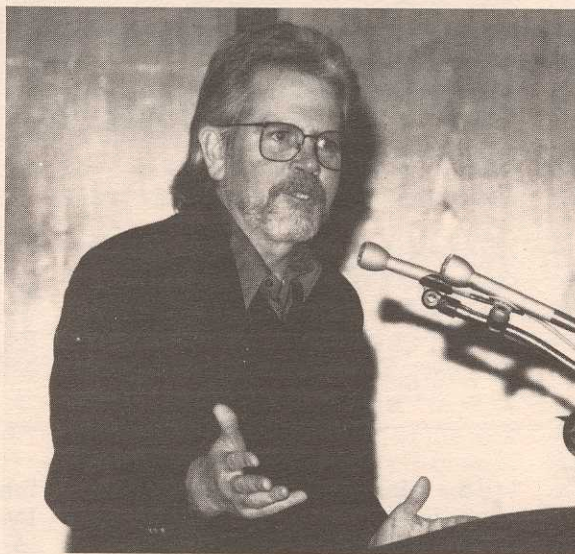
Presenting the first Julia-Jean Nelson Rudd lecture, Tom Regan speaks on the topic of animal rights.